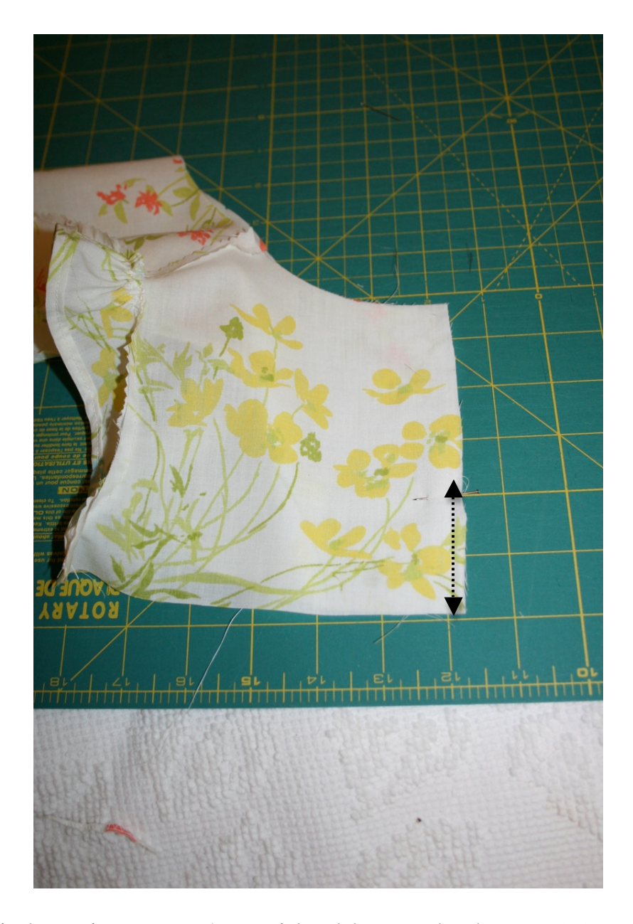
Next do the sides. You only need to stitch up about .75 inch here but it needs to be put all together to attach the skirt next. See the next picture