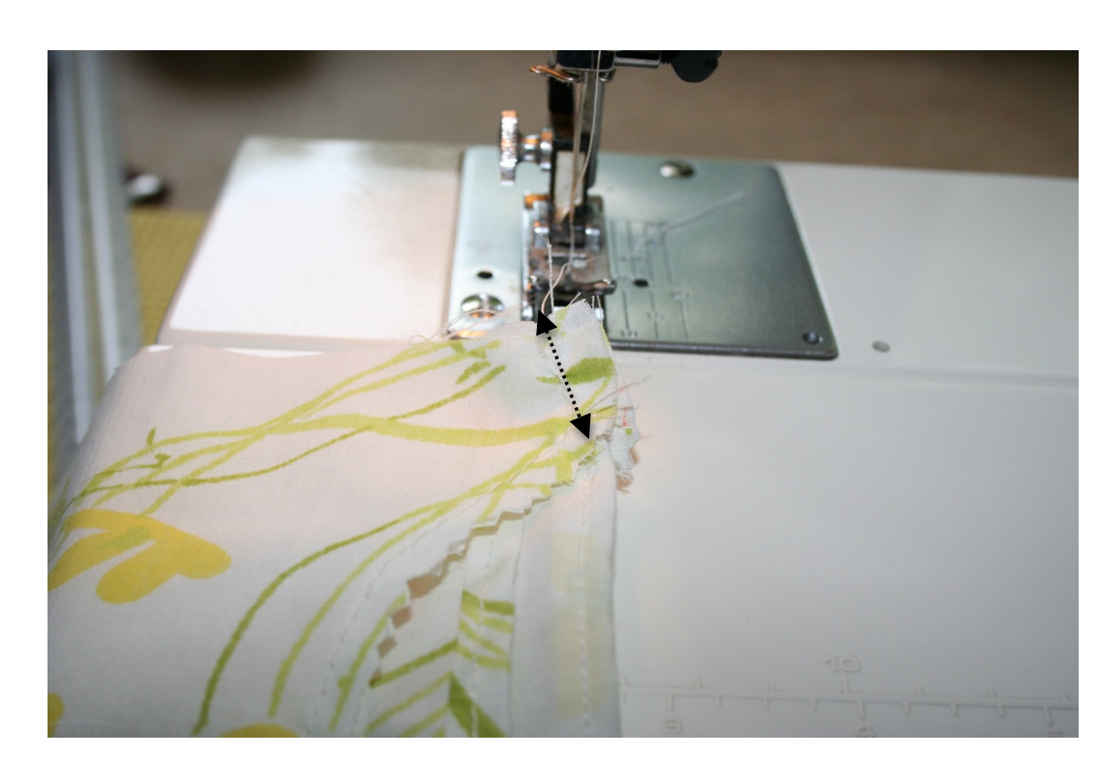
Use your pinking shears again on this little seam.