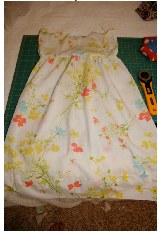
Now do your button and button hole! Finished!

Now I turn it right side out again and iron around where you attached the skirt to the top. Then stich around about a 1/4" above the seam to secure the edge below.